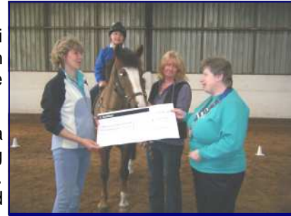
Presentation of £1000 cheque